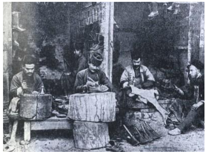
Craftsmen from Shusha

As the economic and household needs of the population of Shusha were not fully met by industrial products, a number of artisan workshops were still on operation. One of such types of handicrafts was the footwear manufacturing - shoemaking . In the early twentieth century, there was a decline in this field. The main reason for this was the establishment of shoe factories. Shoemakers used to make