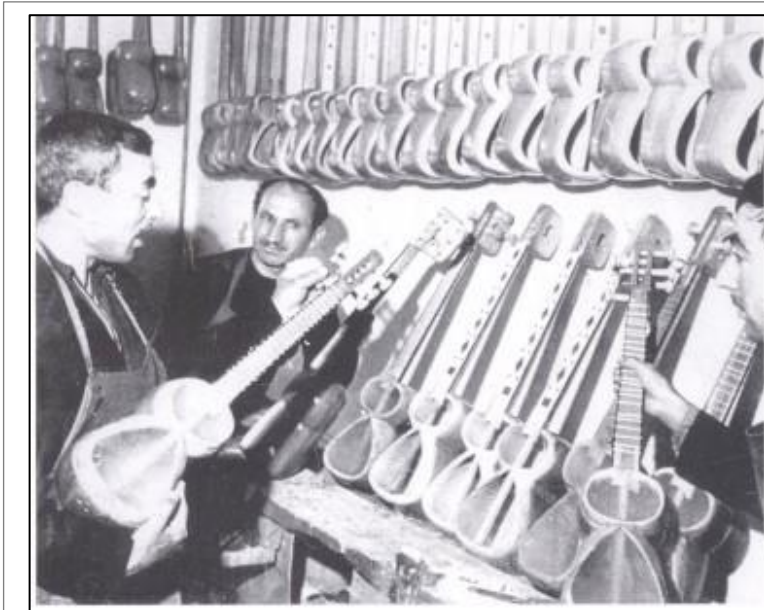
Musical instruments workshop in Shusha

In the 1970s, new water and natural gas pipelines were laid to Shusha, a new hotel, a