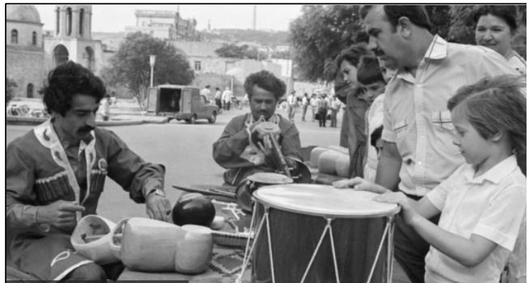
Craftsmen from Shusha during the Soviet period

strong impact on the development of the art of dyeing here. Cultivation of boyagotu (dye plant), considered an indispensable raw material for the purchase of red colour and its various shades, was also developed in the Karabakh khanate. Some part of the 10,000