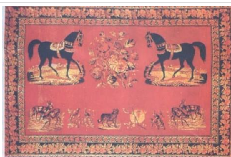
Carpet, woven in Shusha

As early as the Middle Ages, Shusha carpets were famous for their production techniques, variety of colour shades and richness of artistic design. In the second half of the 19th century and early 20th century Shusha was the centre of carpet production and sales in Karabakh. Carpet weaving, previously produced to meet