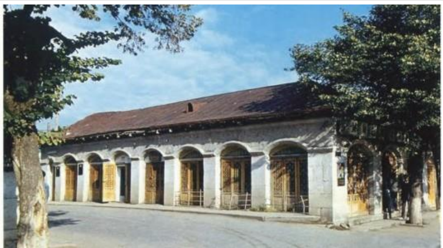
Caravanserai belonging to Khurshidbanu Natavan

In the late 1970s - early 1980s, the mansions of the Zohrabbeyovs and Haji Gulu were renovated, the walls of the ancient fortress were restored, the house-museums of Vagif, Natavan, Navvab and other historical figures were