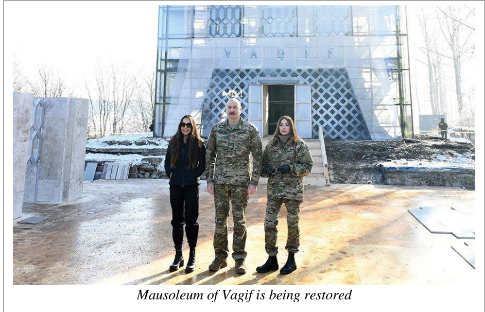
Mausoleum of Vagif is being restored

In Shusha, along with the historical and architectural