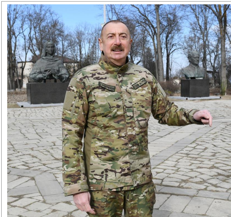
Monuments are being restored in their places.

After the liberation of Shusha on November 8, 2020, it turned out, that the Armenians committed acts of vandalism against the material and cultural properties of the city belonging to Azerbaijanis. President Ilham Aliyev said this during his visit to Shusha on January 15, 2021, visiting architectural monuments of the city together with his family: “When I came to Shusha today, I brought the busts of our geniuses Khurshidbanu Natavan, Uzeyir Hajibayli and Bulbul, which were kept in the yard of the Art Museum in Baku for almost 30 years, At this place was the House of Culture, and it was here that the busts of Uzeyir bey and Bulbul were installed. The hated enemy destroyed the Shusha House of Culture and shot the busts of our genius personalities.”