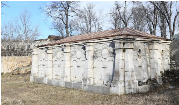
Spring of "Khan gizi"

The baths built in Shusha were famous for their original architectural style. Various types of tiles, colored glasses and marble were widely used in the decoration of the baths. The first bathhouse in Shusha was built by Ibrahim Khalil Khan's cousin Abdusamad bey. Later, there were