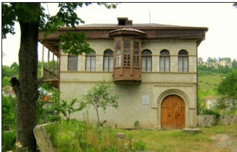
House of Mehmandarovs

contribution to solve the water problem of the city. In 1871, she financed water injection through pottery pipes from Mount Khalfali, located 7 km from Shusha, to the city and the construction of