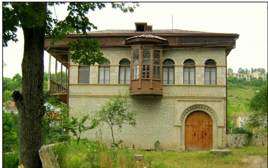
Carpet museum. (The house of Mehmandarovs)

The ancient objects from our historical past were displayed here. The exhibits of the museum consisted of decorative stones with national patterns, inscriptions carved from various products, column stairs and other beautiful architectural samples.