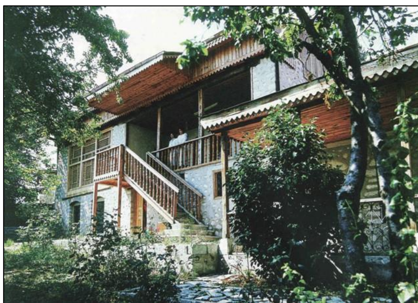
House museum of Uzeyir Hajibeyov

The appearance of the museum house of Shusha, the founder of Azerbaijani professional music Uzeyir bey Hajibeyov, attracted special attention. Some elements of the Azerbaijani national-architectural art were used with great pleasure when creating U.Hajibeyov's house museum. The museum is