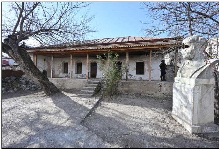
House museum of Bulbul (after the occupation)

materials, samples of material culture, household items, ancient coins, photographs and other auxiliary materials obtained because of excavations in various regions, villages and in Shusha itself. In the other hall, materials dedicated to the medieval period of Karabakh were collected. Among the items on display were tools, weapons, pottery, and handicrafts from that period. The museum also kept documents on the activities of prominent figures of Karabakh, manuscripts of figures of science, literature and art, materials related to state figures. Other halls of the museum displayed materials from the XIX-XX centuries. The museum also kept materials on the flora and fauna of Shusha, underground and surface natural resources.