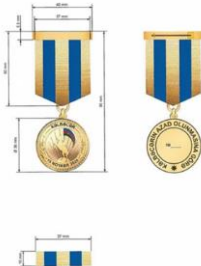
"Kəlbəcərin azad olunmasına görə" Azərbaycan Respublikasının medalı

The medal of the Republic of Azerbaijan "For the liberation of Kalbajar" is worn on the left side of the chest, in the presence of other orders and medals of the Republic of Azerbaijan - after the medal "For the liberation of Shusha".