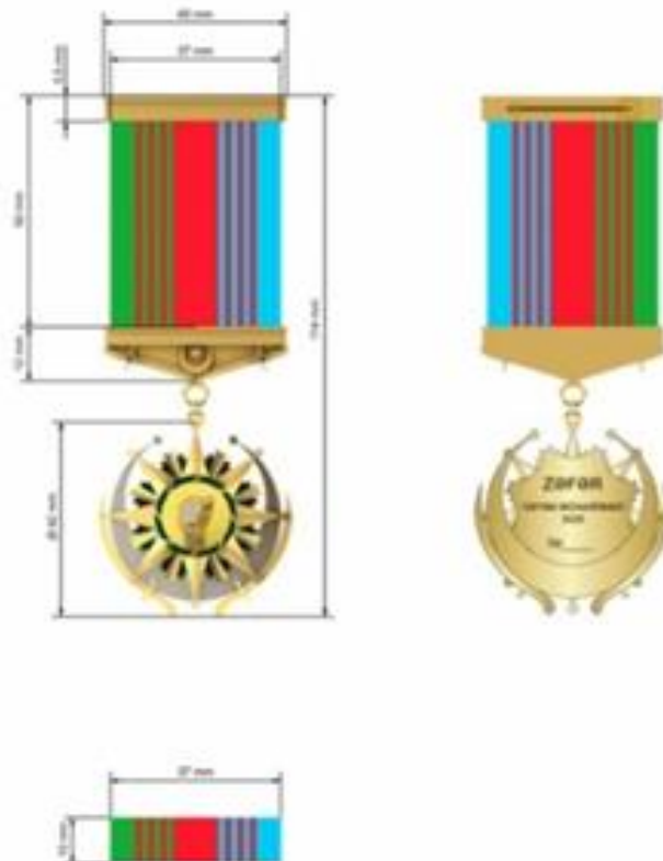
Azərbaycan Respublikasının “Zafar” ordeni

The “Zafar” Order of the Republic of Azerbaijan is worn on the left side of the chest, in the presence of other orders and medals of the Republic of Azerbaijan - after the Order of Heydar Aliyev.